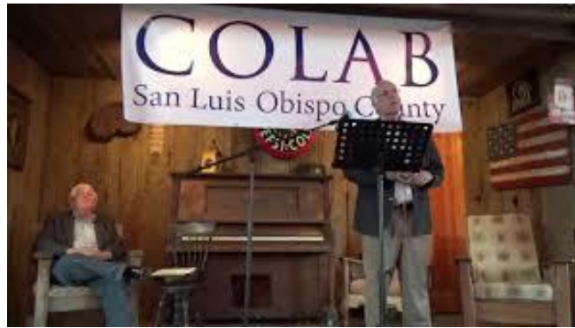
VICTOR DAVIS HANSON ADDRESSES A COLAB FORUM